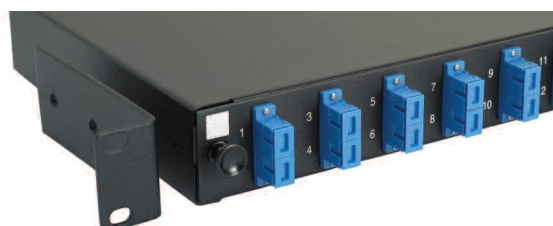
C. Adjustable fixing arms, clear port and panel labelling