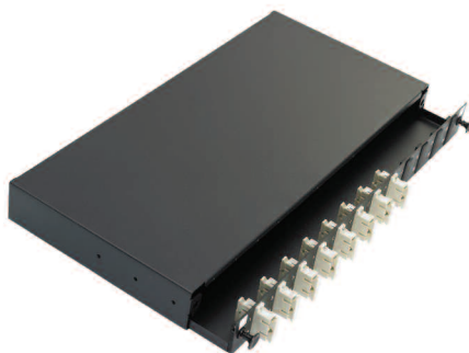
A. Sliding drawer design

The Excel range of SC patch panels are sliding drawer 'tray style' housings suitable for either direct termination or splicing of upto 48 fibres in 1u of rack space. Each panel is manufactured from high quality 2mm thick steel and finished in Black powder coated paint to provide a strong and durable unit. To the front of the patch panel the specified number of duplex adaptors are loaded from left to right. The fascia also houses the release latches for the sliding drawer. Each panels utilises colour coded adaptors, Beige for multimode, Blue for singlemode. Each duplex adaptor accommodates two terminated fibres. Each panel has included within it a set of adjustable fixing arms, and a cable management pack which includes cable entry glands, cable ties, and a 24 way splice bridge.