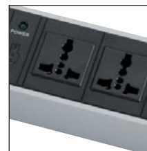
GB2099.3 universal sockets