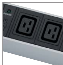
IEC320 C19 16AMP sockets