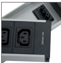
Snap in module design IEC320 C13 10AMP sockets shown

To add to the flexibility of product choice and configuration, modules can be ‘hot swapped’ at any time after initial installation. Simply detach devices connected to the module which needs to be swapped, remove the original module and snap in the replacement. All other modules remain fully operational, reducing installation time, equipment down time, and extending the useable lifetime of the power strip unit itself.