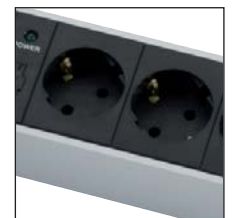
DIN49440 Schuko sockets**